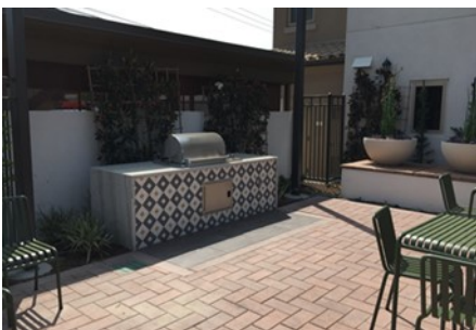
(Patio with BBQ for everyone to use.)