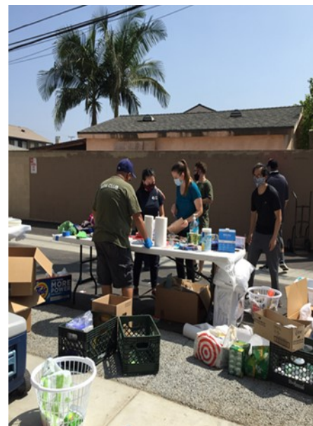
(Volunteers collecting their list of what goes in each unit.)