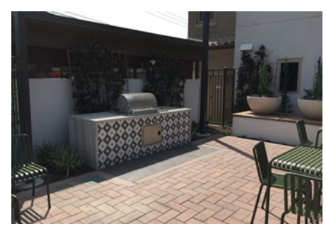
(Patio with BBQ for everyone to use.)