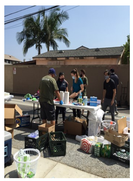
(Volunteers collecting their list of what goes in each unit.)